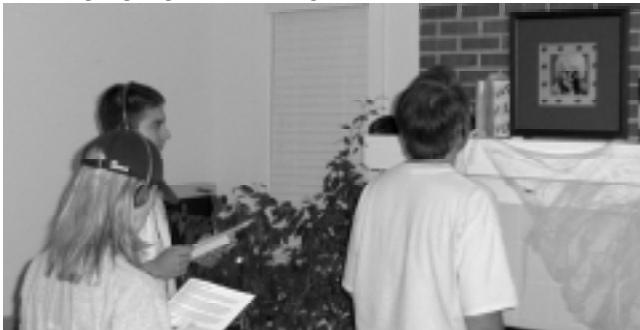
Fig. 1. Viewing the Digital Family Portrait