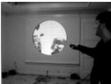
Fig. 6. Revealing a partial scene in the bedroom wall

In the first bedroom, a doll’s head followed the sound of a baby’s squeak toy. (Fig. 5) A phased array microphone [6] directed a pan and tilt camera head to follow the sound sources.