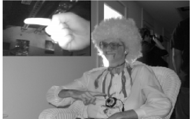
Fig. 2. Grandma turning up the volume on the television

old while they listened to the story of what happened through their wearable audio device.