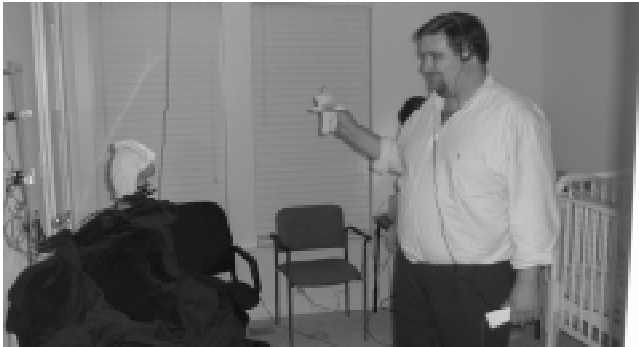
Fig. 5. Trying to get the baby’s attention

In the den, visitors used a laser pen to draw symbols on the wall. (Fig. 4) Through the use of a computer vision system and a video projection unit, the user appeared to leave a trail of scorch marks on the wall. If the user drew the correct symbol, she was rewarded with more of the story line. However, incorrect symbols were punished with a “scary” animation.