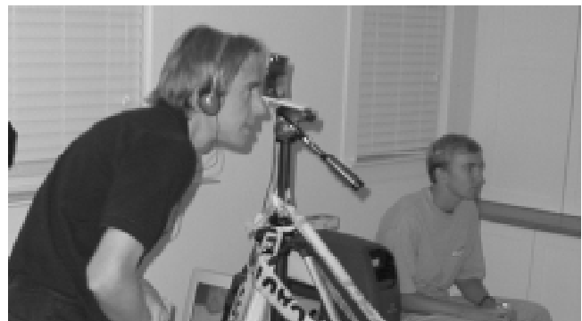
Fig. 3. Watching ghosts in the kitchen

After turning from the portrait to the rest of the living room, the guests watched grandma's ghost control her appliances with the Gesture Pendant [5]. (Fig. 2) For this demonstration, grandma switched between television channels and controlled the lights with simple hand gestures.