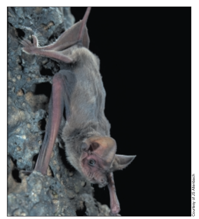
Figure 1. The Brazilian free-tailed bat (Tadarida brasiliensis).

The unit for our analysis is the individual female bat, because relatively few males roost in these large maternity colonies. Because damage to the crop occurs in the larval stage of H zea , our goal was to estimate the number of larvae "prevented" from reaching maturity by the presence of a single bat. The overall impact on agriculture is estimated by scaling up our population estimates of bat colonies in the study area. The model we develop is a