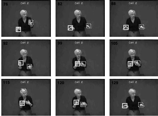
Figure 4: Tracked hand locations in the Flemish Sign Language [20] video “NGT-AH_fab2_b.mpg”.

based on the same Gaussian model of 2-D location as in our method, Eq.10. The update is based on skin probability, normalized correlation score and blockflow of the new sample, using the same model and parameter values as in our method. For the four sequences tested it was observed that CONDENSATION tends to drift when there are occlusions or hands are moving fast. When CONDENSATION loses track, it has no mechanism to reset itself. Table 1 compares the results of our algorithm versus CONDENSATION.