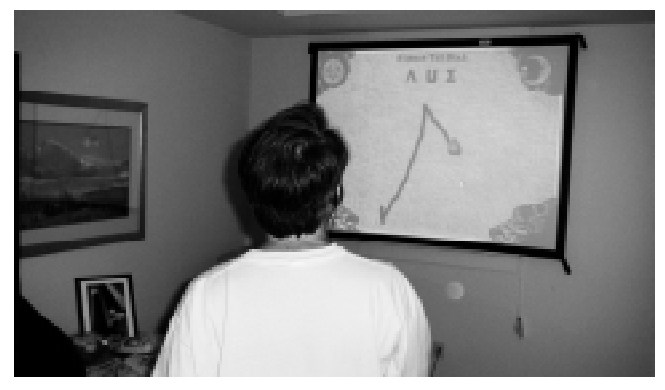
Fig. 4. Etching on the walls with a laser pointer