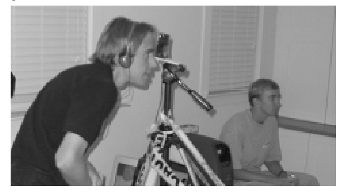
Fig. 3. Watching ghosts in the kitchen

After turning from the portrait to the rest of the living room, the guests watched grandma's ghost control her appliances with the Gesture Pendant [5]. (Fig. 2) For this demonstration, grandma switched between television channels and controlled the lights with simple hand gestures.