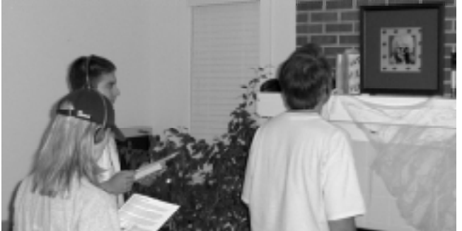
Fig. 1. Viewing the Digital Family Portrait