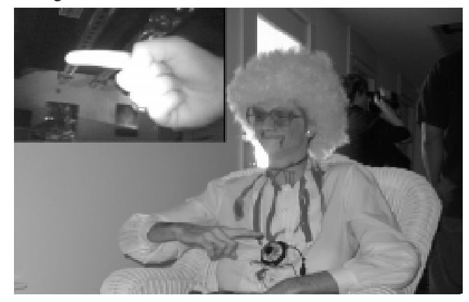
Fig. 2. Grandma turning up the volume on the television

old while they listened to the story of what happened through their wearable audio device.